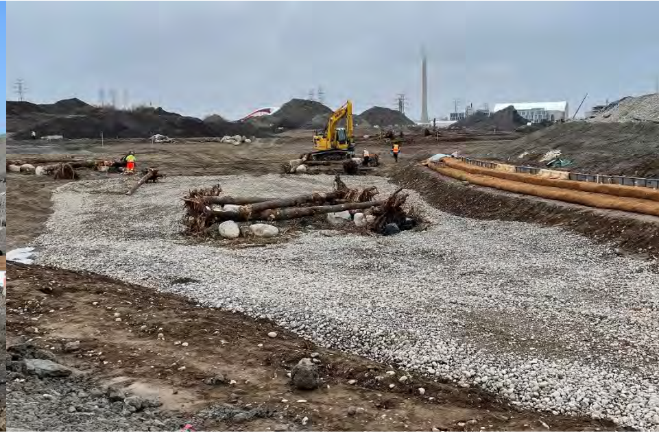
Fish and Bird Habitat – Downed trees mostly underwater