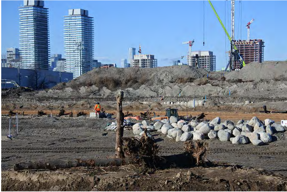
Fish and Bird Habitat – Upright drowned trees