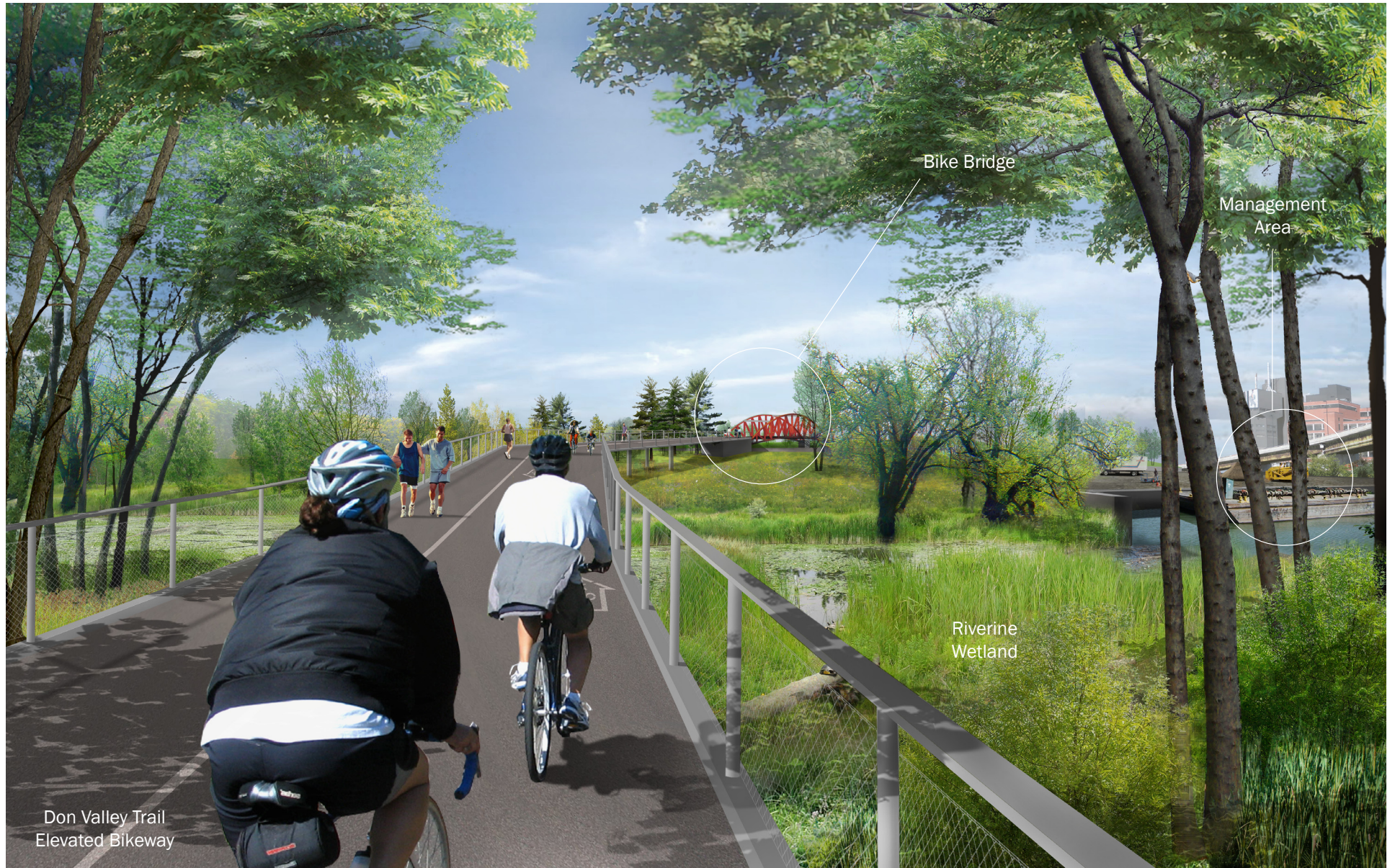
Don Valley Trail Elevated Bikeway