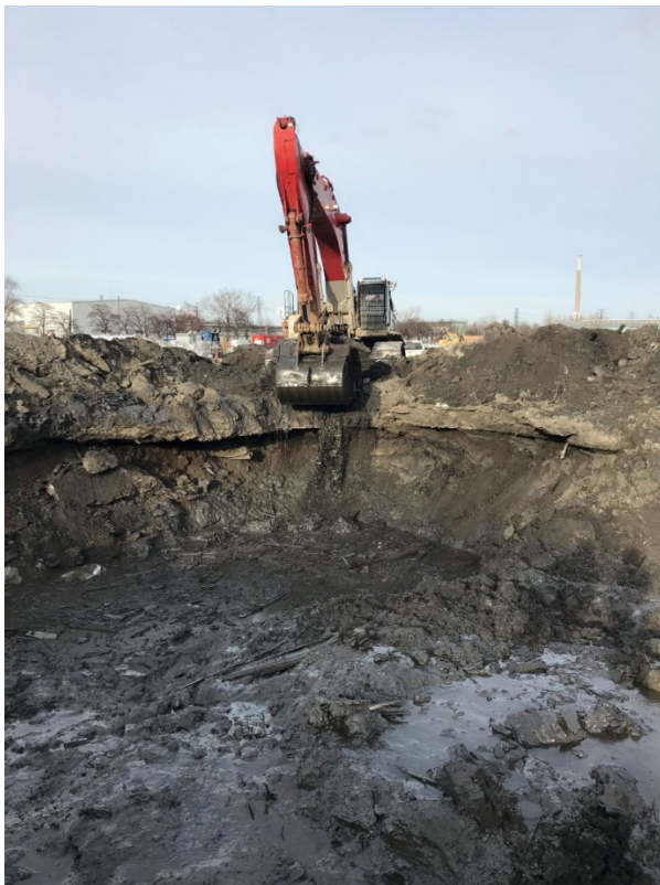
Removing underground obstructions as part of the excavation process.