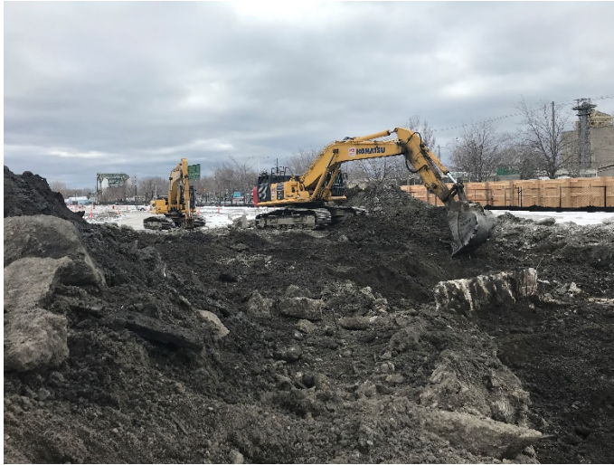
Excavation of the new river valley.