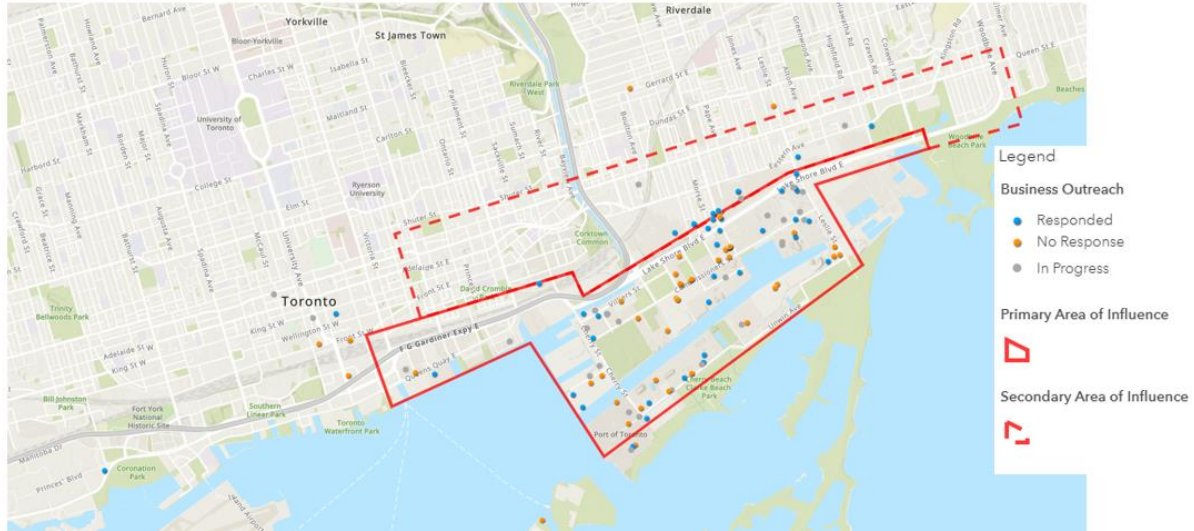
Figure 2: Outreach to Businesses in the primary and secondary areas of influence.

Figure 2 maps the 101 businesses we contacted with information about the LSBE project. Due to COVID restrictions, contact was made by email and phone. Meetings were set up virtually with those who responded.