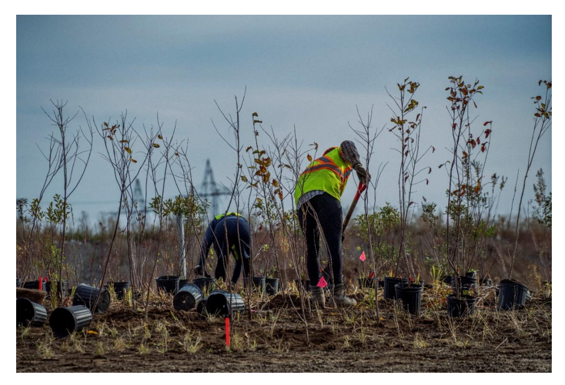
Above: Planting started in May and continued through until the fall. During planting seasons, 18,000 – 22,000 plants are delivered weekly to the construction site.