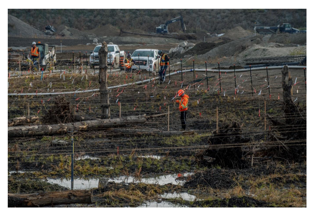
Above: After a wetland is planted, we string up wires with colourful ribbon on them to discourage birds from disturbing the plants before they have had time to establish.