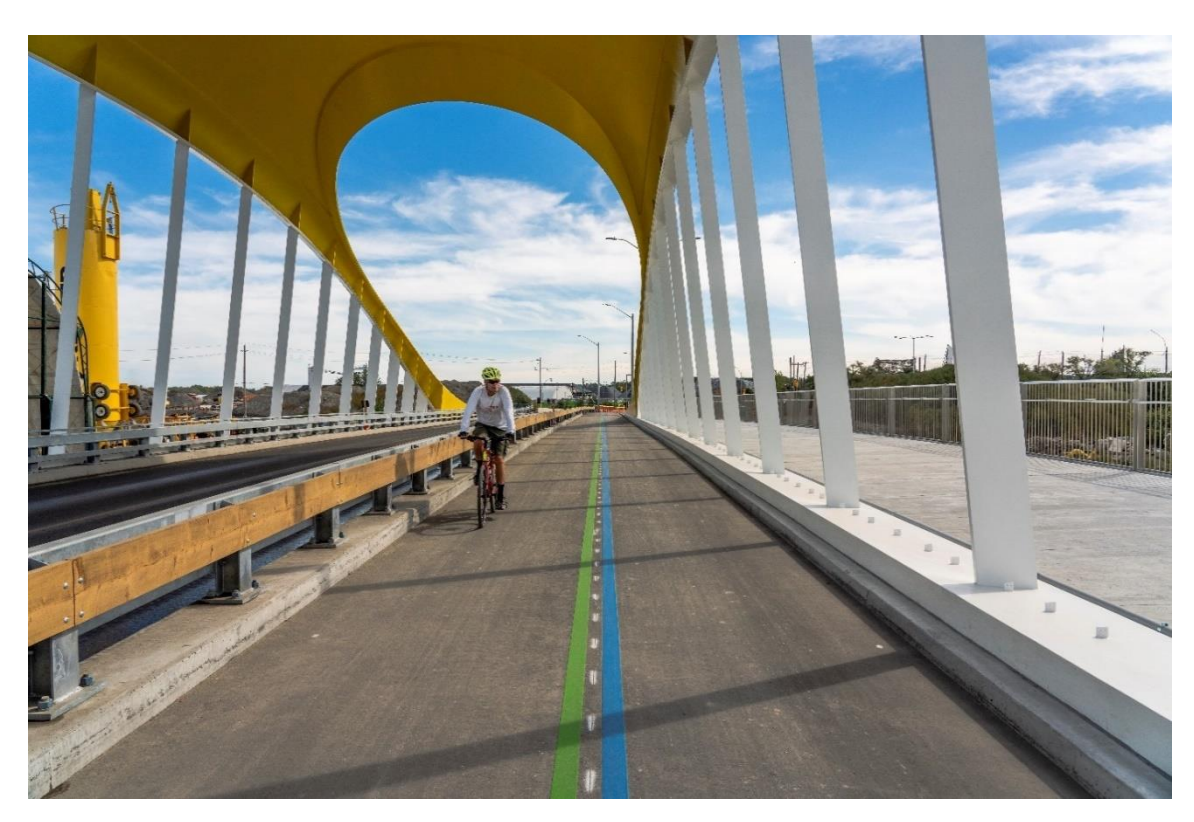
Above: The Cherry Street South Bridge opened to the public in October, 2022. It includes a fully separated bike lane and sidewalk.