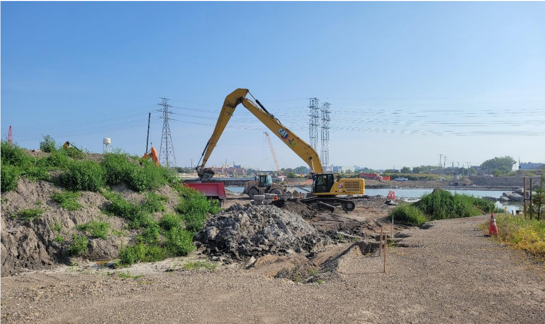
Excavators near the north end of the river, along what used to be Villiers Street are removing soil stockpiles to allow for placement of river finishes where the new river valley will connect to the Keating Channel.