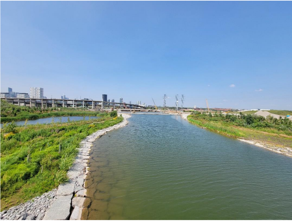
Looking north from the Commissioners Street Bridge, you can see the cutoff wall that is separating the new river valley from the existing Don River and Keating Channel. It will be removed by the end of the year.