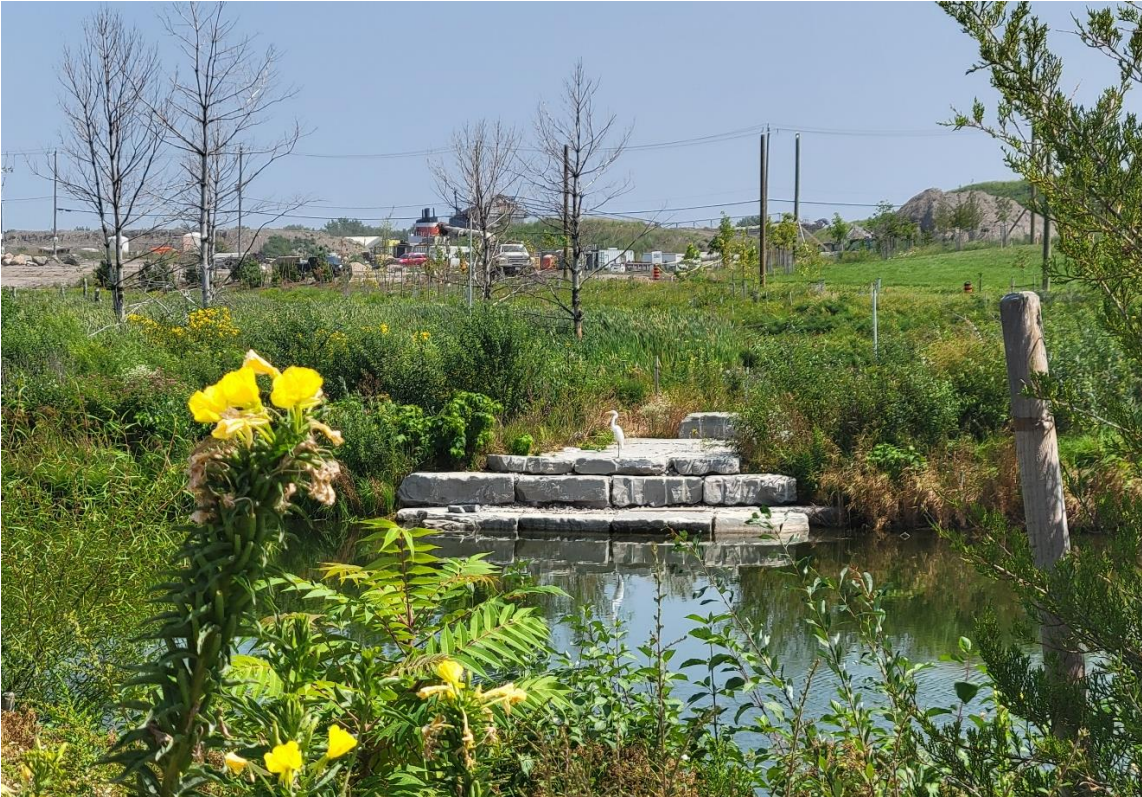
The plants along the new river have continued to grow throughout the summer, attracting wildlife like this egret.