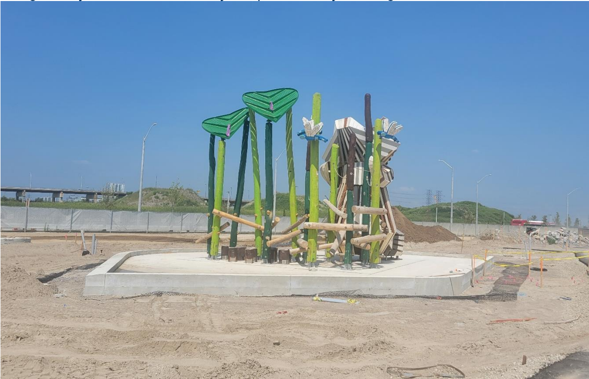
The 'reaching raccoon' is a structure to climb and incorporates a slide. Now crews are working on the curbs and nearby paths before adding plantings.