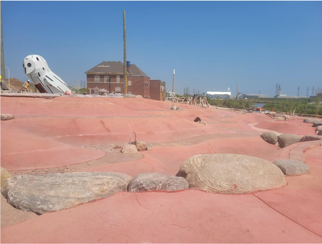
The red landscape is the 'badlands scramble', an interactive water-play feature in the new playground. In the background, you can see the recently completed snowy-owl stage and historic Fire Hall 30.