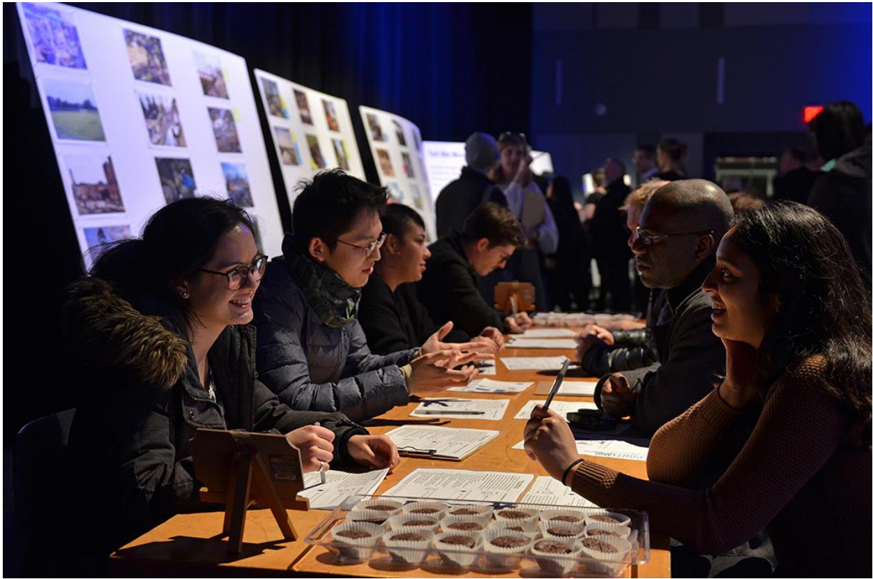
Introducing strangers to help us all learn through new perspectives at a February 2019 public meeting.

Most comments fit into the theme of Accessible Uses and Affordable Housing, Ecological Balance and Street Design and Transportation.