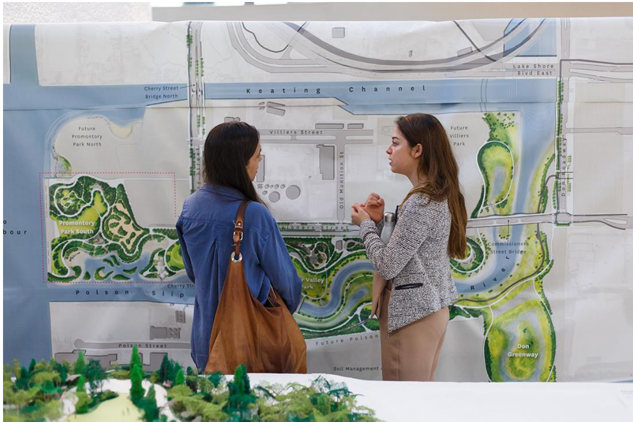
A public Information Centre at Toronto City Hall in 2019 opened for two full days, allowing people to drop in any time and discuss the latest designs with the project team.