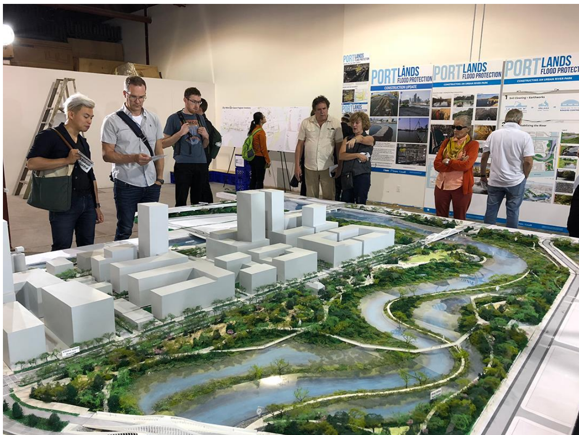
A scale model on display at the Port Lands Drop-In Centre, which was open for one month on Queens Quay East in fall 2019.

Suggested uses included comments that supported or suggested free and accessible activities and programs in the park, including canoe and kayak rentals, dog parks, splash pads, grills and food stations/kiosks and walking trails.