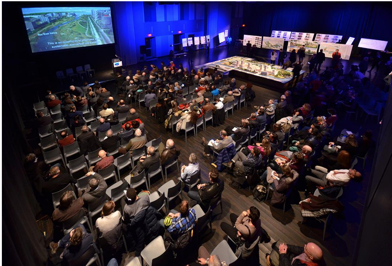
Community Consultation in February 2018: Our first big public meeting after getting project funding. 275 people attended in person and 900 people attended digitally.

People were supportive of creating extensive bike infrastructure through connectivity to other paths, a bike share system and bike parking. In comments related to street design, people identified a preference to keep different modes of transportation (such as bikes and public transit) separate. They also recommended using familiar road design for the streets. People supported public transit and suggested ways to reduce cars.