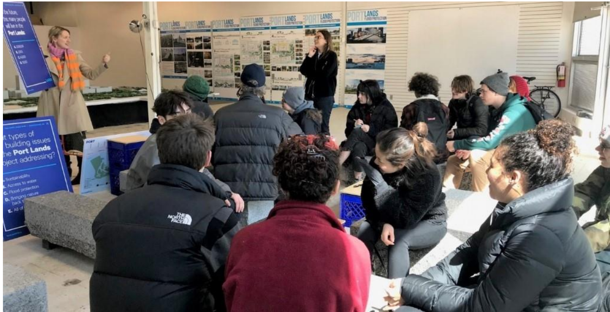
One of three workshops held with high-school students in partnership with the Toronto District School Board in April 2019.

Over 150,000 people engaged with our public consultations or online content. 5,325 people (3%) participated in a face-to-face consultation. The remainder engaged with us online and through social media.