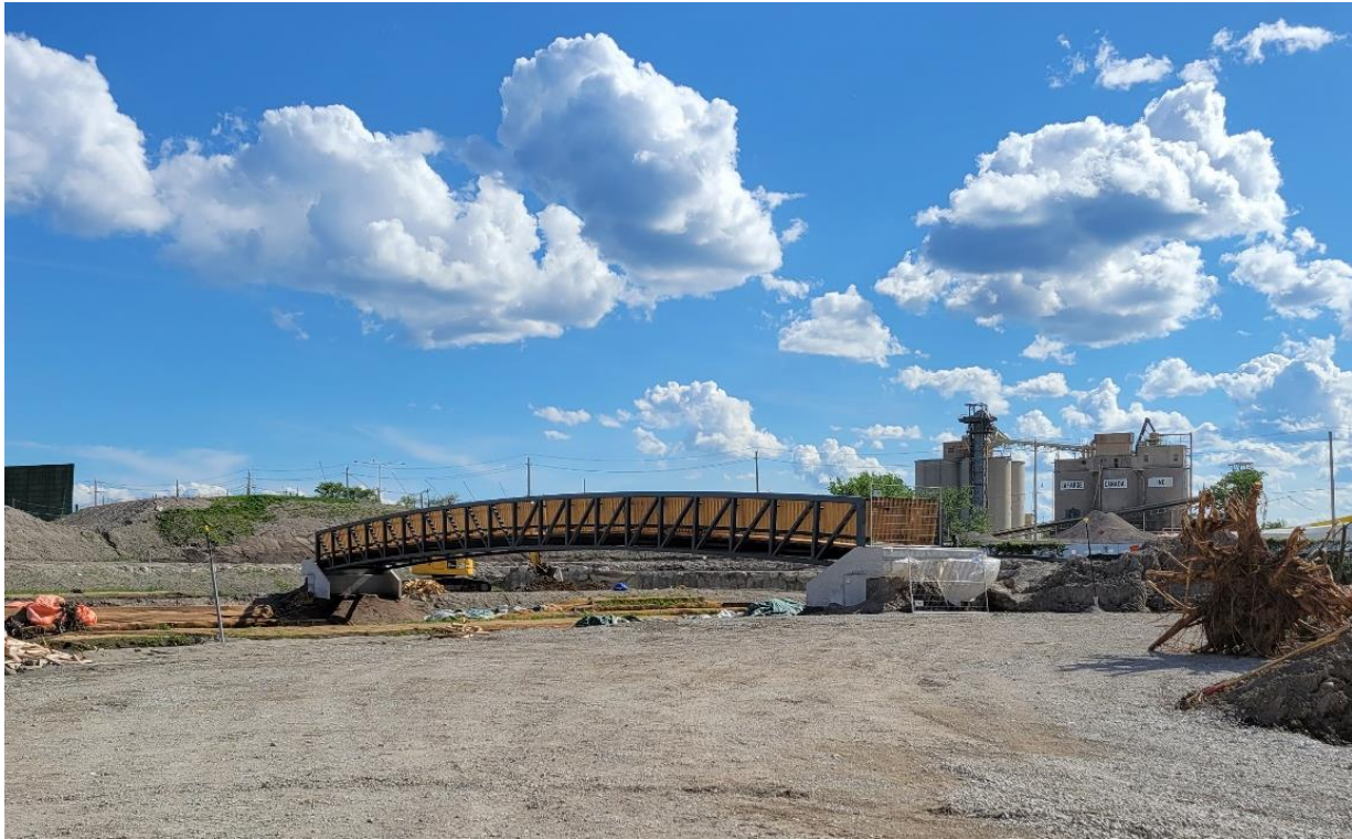
Above: The second of the two pedestrian bridges crosses what will be the main river channel, to connect the parks on either bank.