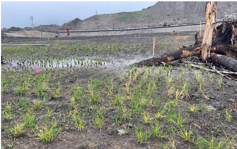
Above: We've started planting wetland plants on the north side of the main river channel. The large logs on the right will also be part of the wetland, and provide variety to the habitat.