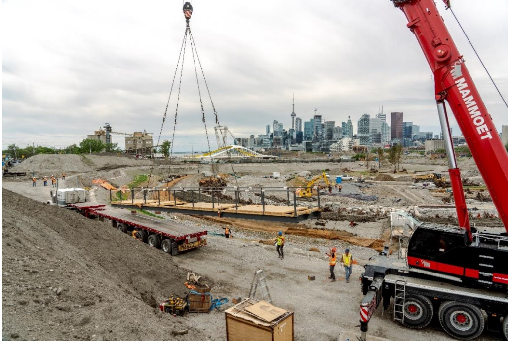
Above: The pedestrian bridges were pre-fabricated and arrived on a truck. Then they were lifted into place by a crane.