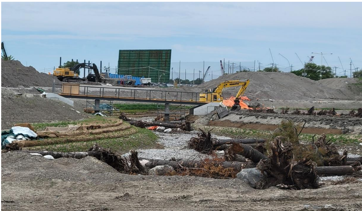
Above: Two pedestrian bridges were installed in June. This one spans the wetland in River Park South.