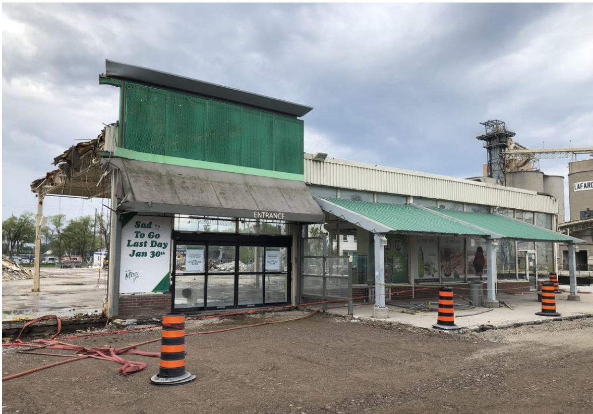
Above: Demolition of T+T Supermarket has started, the first step in preparing to excavate a new mouth for the Don River. This façade will remain in place until nesting birds vacate their temporary home here.