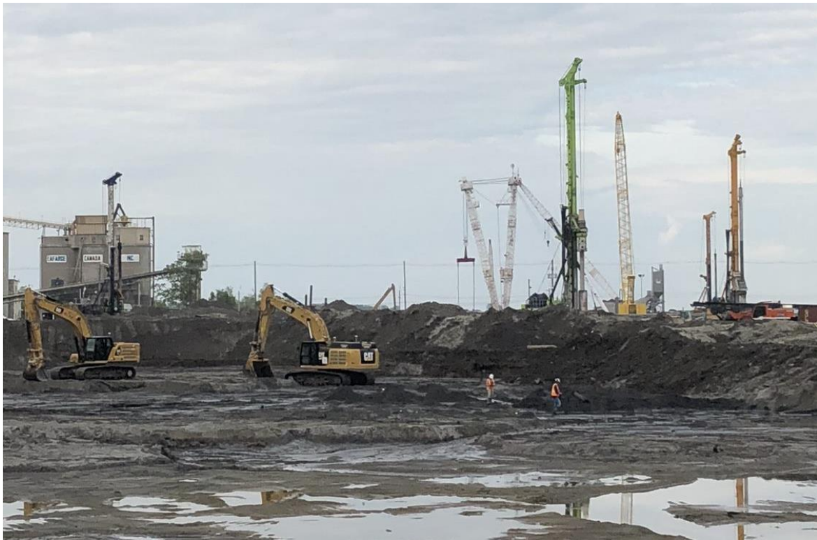
Above: Deep excavation of the river valley has started, reaching as deep as four metres at some locations.