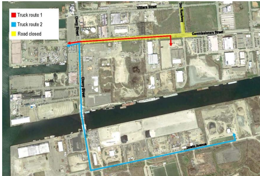
Above: This map shows construction truck routes for June 2020.

Expect a temporary increase in construction traffic along Unwin Avenue and Cherry Street as trucks deliver soil to the location of future Cherry Street for pre-loading.