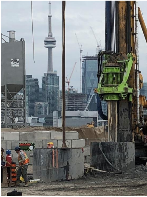
Above: Installing foundations and abutments for the Cherry Street South Bridge.