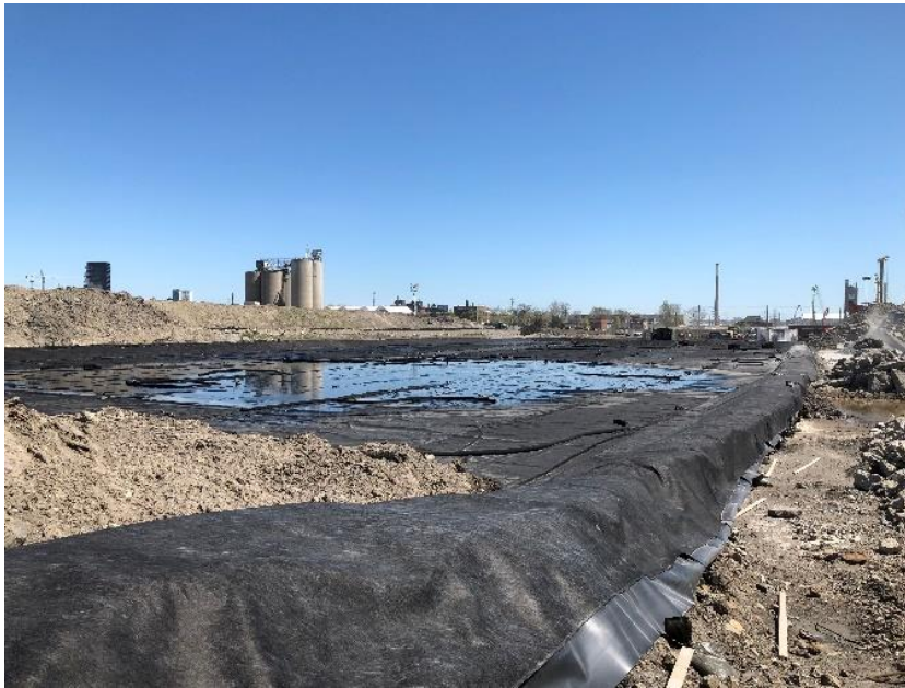
Above: Soil will be stockpiled at the Cherry Street Lakefilling site, the former Essroc Quay. Shown here is a liner that has been installed in the stockpile area.