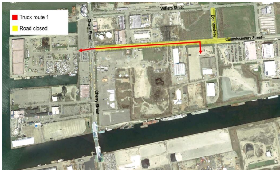
Above: This map shows construction truck routes post June 2020.