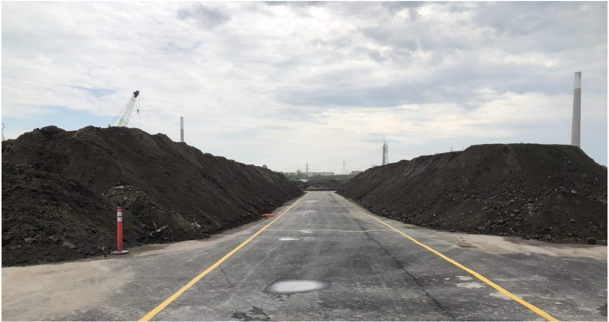
Above: This is the site of the soil management area. A large asphalt pad has been completed to support the structures that will be used to clean up contaminated fill before it is reused elsewhere on site.