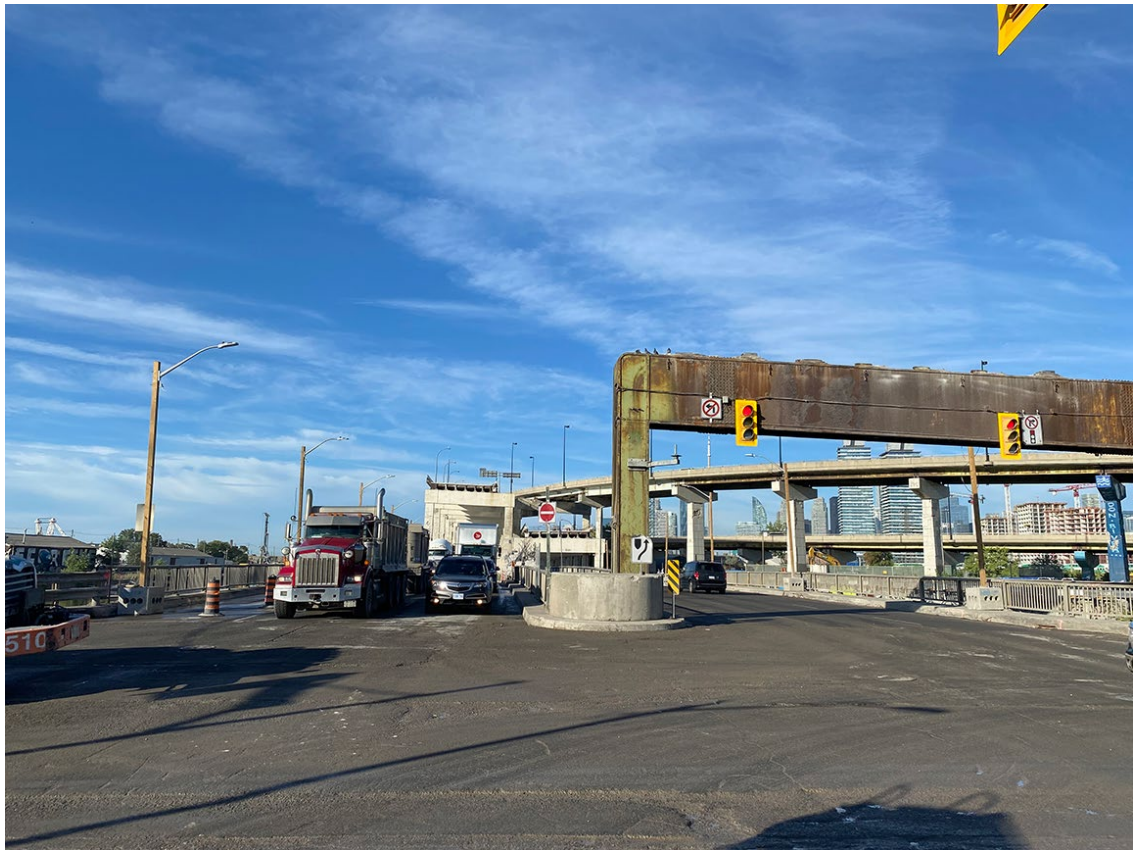
Above: Looking west at Don Roadway, you can see the last remaining steel bent. This bent will be removed as soon as the traffic lights are relocated to a new structure.