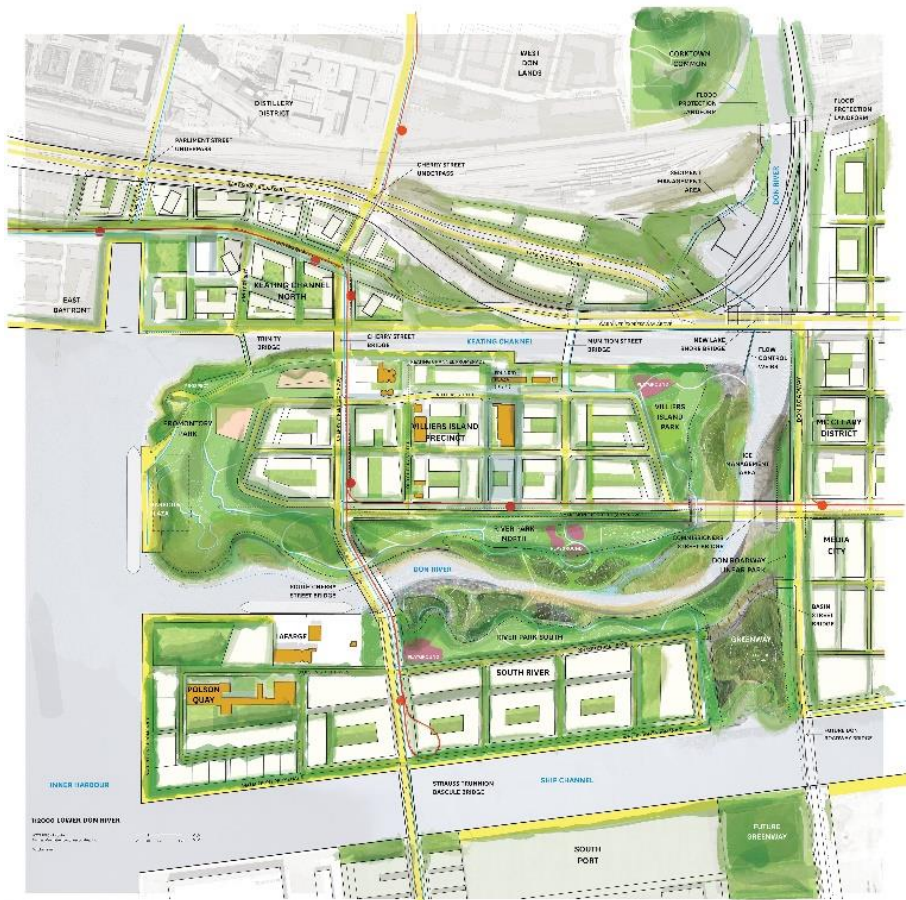
Aerial view of proposed full vision for the Port Lands Flood Protection Project

The Port Lands Flood Protection and Enabling Infrastructure Project is a comprehensive plan for flood protecting 290 hectares (715 acres) of southeastern downtown Toronto – including parts of the Port Lands, South Riverdale, Leslieville, south of Eastern Avenue and the First Gulf/Unilever development site – that are at risk of flooding. The Project addresses the fundamental challenge of transforming the underused and post-industrial Port Lands into a long-term asset that will support Toronto’s growth and economic competitiveness.